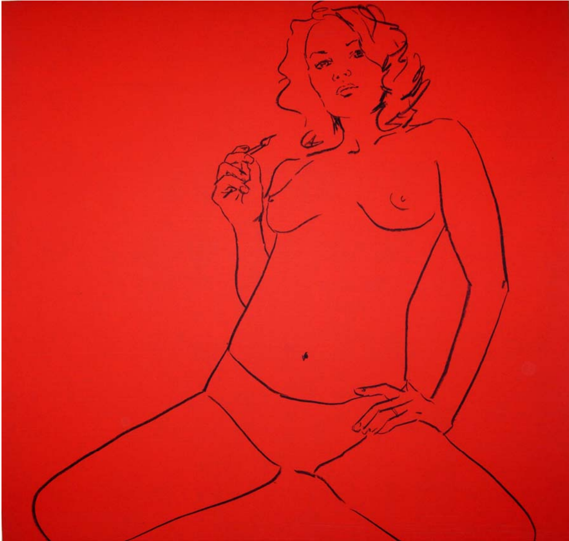
Portrait of the Artist as an Artist (Part 1) acrylic on board 90 x 90 cm (2007)