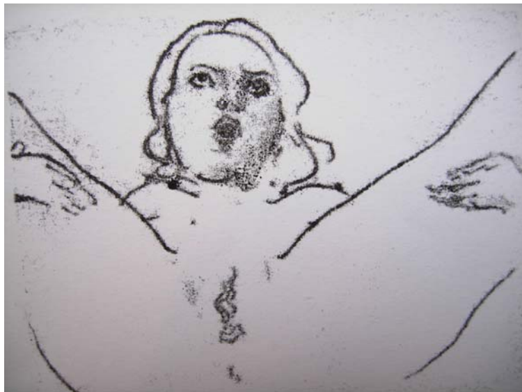
Legs Spread 'O' monoprint 21 x 30 cm (2006)