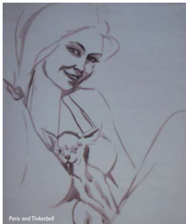
Paris and Tinkerbell